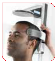
Exact measurement results are guaranteed by precise positioning of the head made possible with the seca Frankfurt Line.