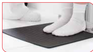
Patients can stand comfortably on the rubber mat of the seca 264 while the heel positioner makes sure those bare feet are in the right place on the platform.