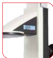
The white backlit display on the headpiece is very easy to read.