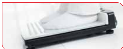
The stable glass platform of the seca 274 with integrated heel positioner guarantees precise measurements and firm and safe footing.

It's all the same if you decide in favor of the wall-installed seca 264 or the free-standing seca 274 because both provide precise height measurement to the millimeter. Noteworthy features include the three-part measuring rod of high-quality aluminum and the robust headpiece, which glides smoothly along the rod. All the while the patient stands safe and secure – even with wet feet.