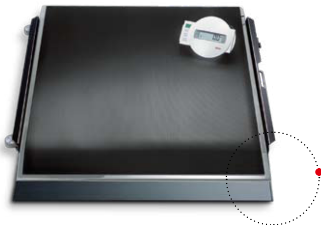
A ramp for easy roll-on of wheelchair is included in delivery.